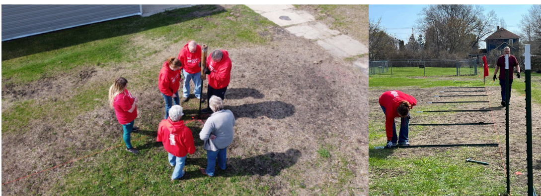
The Barr Team from Keller Williams Real Estate puts up fencing