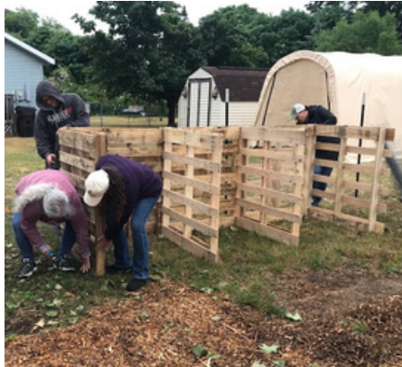
Compost bins being constructed