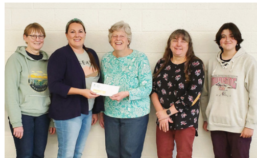
Check presented from the SCD

A $4,000.00 grant was awarded to the MCGG from the Schoolcraft Conservation District (SCD), as well as a $1,000.00 grant from the Sustainable Forests of the UP and another $1000.00 grant from Central Marine Logistics. Besides those mentioned above, several groups and community individuals donated their time and/or money to bring this project to fruition. Hartman Excavation donated 100 yards of soil and several loads of wood chips. The local tree service and Cloverland Electric Co. also donated wood chips to use for ground cover in the lot. Barr Realty Co. donated several hours to help construct the fence, as did a group of employees from UP Paper.