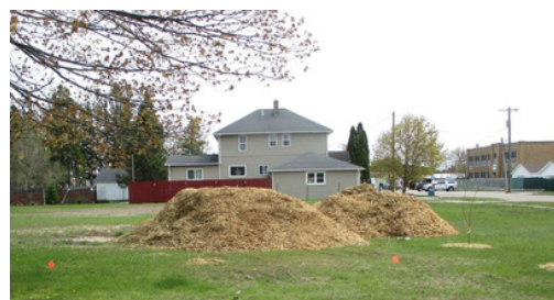
Wood chips donated by Manistique Fence & Tree LLC