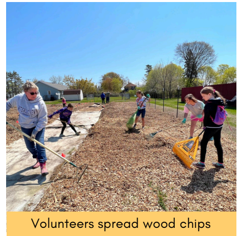
Volunteers spread wood chips