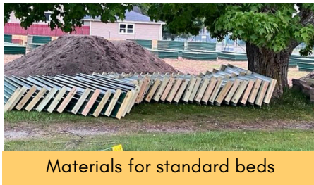
Materials for standard beds

Building began in May, with labor volunteered by community groups and individuals alike. A fence was erected around the garden border, wood chips were spread on the ground, and—most importantly—beds were constructed. 60 beds were made in total: 48 standard-sized, eight with an elevated height to accommodate persons with mobility challenges, and four wheelchair accessible. With the support of the SCD, a composting bin was also installed and several fruit trees planted. The garden opened to the public in early June.