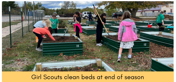
Girl Scouts clean beds at end of season

The success of the garden's first year promises good things for the future. The MCGG looks forward to continuing to expand the garden, including by establishing a pollinator garden, Arts & Sensory area, and shed for tool storage. The hope is that the garden will continue to benefit the Manistique community for decades to come.