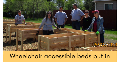
Wheelchair accessible beds put in